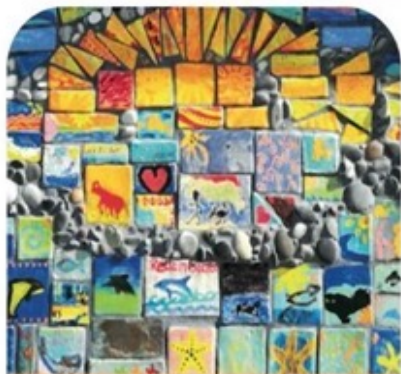
WP2. PartArt4OW Framework - Open calls