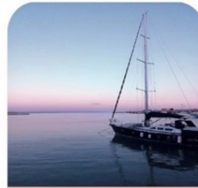
WP4. Stakeholders engagement and ecosystem building