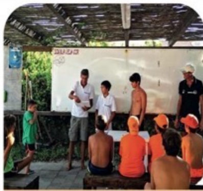
WP3. PartArt4OW support and Accelerator program